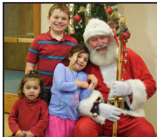
(Left) At Hutchinson Lions Christmas Party they invited some veterans and their families to their dinner and party. Santa brought gifts for the children.