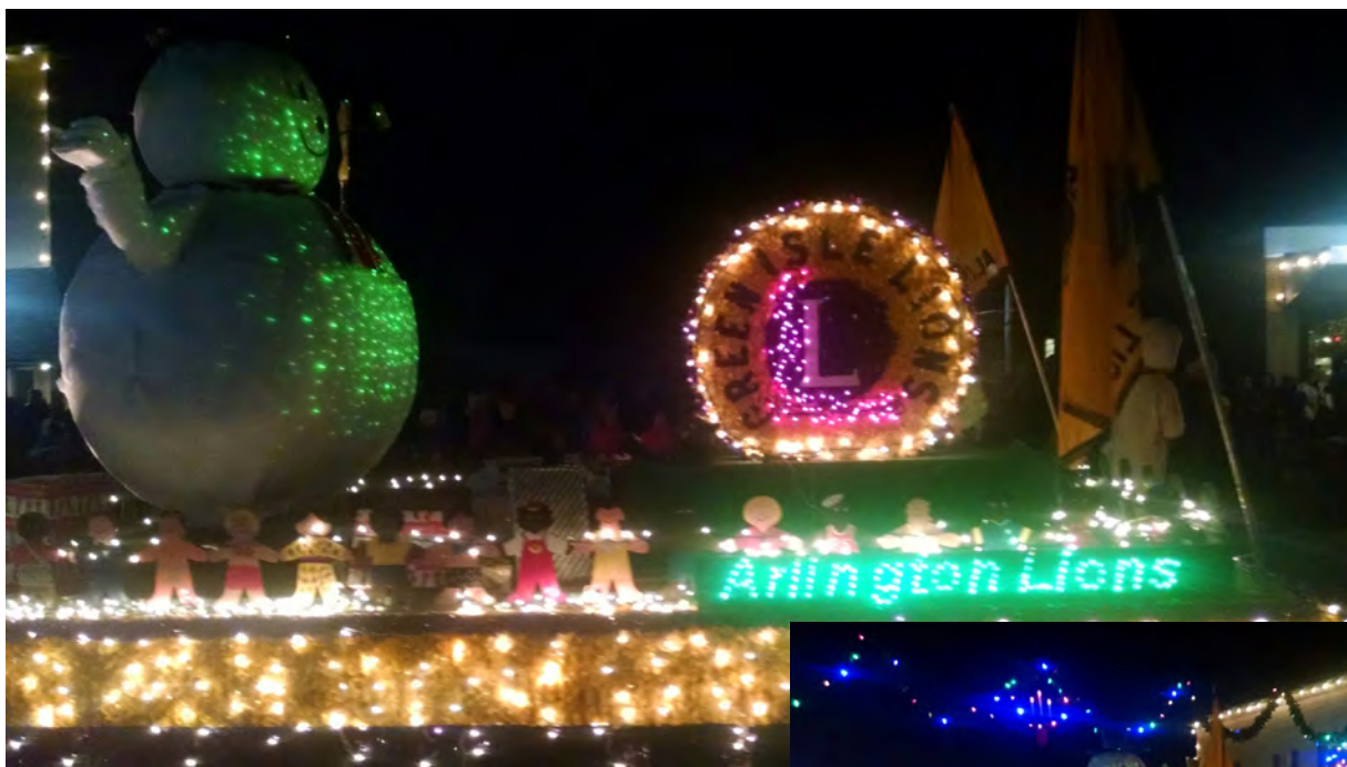
The Arlington and Green Isle Lions collaborated on their float contribution in the recent Arlidazzle Parade in Arlington.